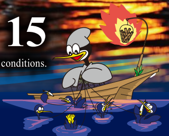
Mascot of Gifu Nagara River Cormorant Fishing, "Ooh-tan"

* The time schedule is subject to change due to the weather conditions, number of boats, other events, etc.