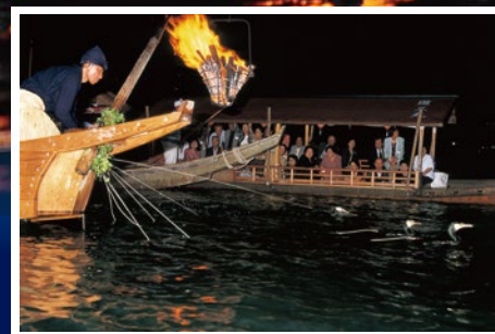
Cormorant fishing viewing (image)

Want to know more about the Nagara River cormorant fishing?