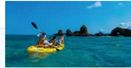
Yagaji Ecotour Network Nature Tour and Canoeing P16