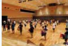
Onna Village Tourism Association Eisa Experience P06 Harvesting and Sugar Making P14 Hari Racing P12 Sanshin Experience P37 Okinawan Home Cooking Class P38