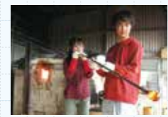
Ishigaki City Tourism Exchange Association Ishigaki-yaki Pottery Studio Ishigaki-yaki Pottery P41