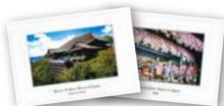
Photo postcards, lapel pins and other giveaway items