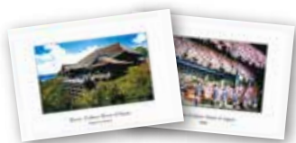
Photo postcards, lapel pins and other giveaway items