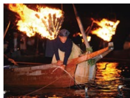
Cormorant Fishing on the Nagara River