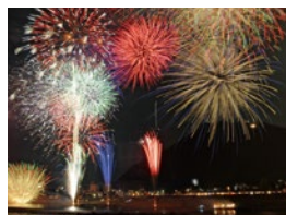
Nagara River Fireworks Festival