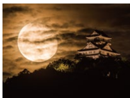
Gifu Castle with a waning gibbous moon